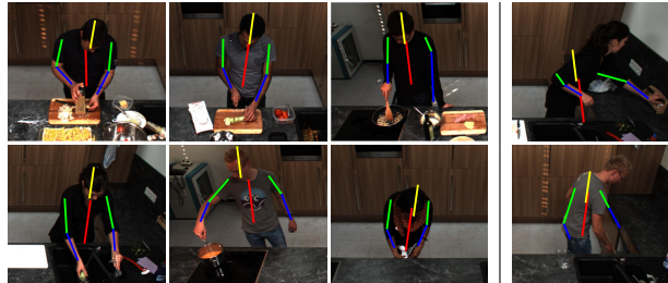
Figure 2. Examples of correctly estimated 2D upper body poses (left) and typical failure cases (right).

The first approach is based on estimates of human body configurations. The purpose of this approach is to investigate the complexity of the pose estimation task on our dataset and to evaluate the applicability of state-of-the-art pose estimation methods in the context of activity recognition.